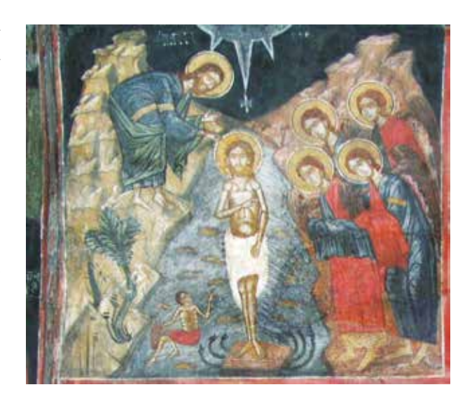
The Baptism of Jesus, a seventeenth century wall painting from the Christological Cycle of the Great Feasts in the nave of the Church of St Atanass, Arbanassi, Bulgaria. (© Elza Tantcheva 2004)

Jėzaus krikštas , XVII a. sienų tapyba iš kristologinio Didžiųjų švenčių ciklo Arbanasio Šv. Atanazo bažnyčios navoje, Bulgarija (© Elza Tantcheva 2004)